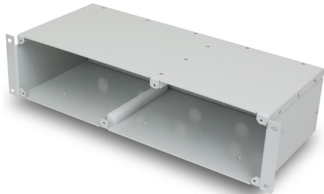
*Reinforcement ribs not shown

The MCC200H Subrack is compact 2.5RU rackmount chassis. It has 2 slots for Microlab's MCC200-4x4 series Hybrid cards. MCC200H is outdoor rated. The subrack has been designed for easy installation of the hybrid cards. It has pass through holes for ports of modular hybrids at the back for interconnection with the filter outputs. The antenna ports are in the front. For unused slots in the subrack, MCC200-A02 blank faceplates can be used.